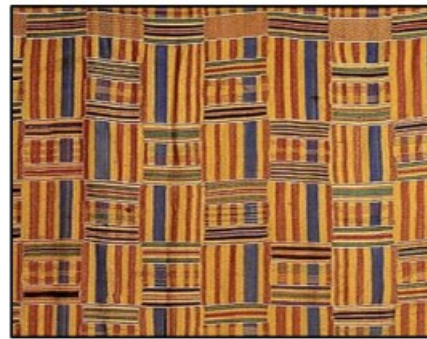
Traditional kente cloth