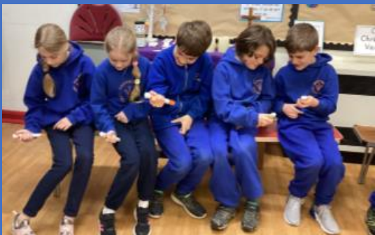
Pupils in Year 5 & 6 learning 'the recovery position', CPR and how to administer an 'epipen'.