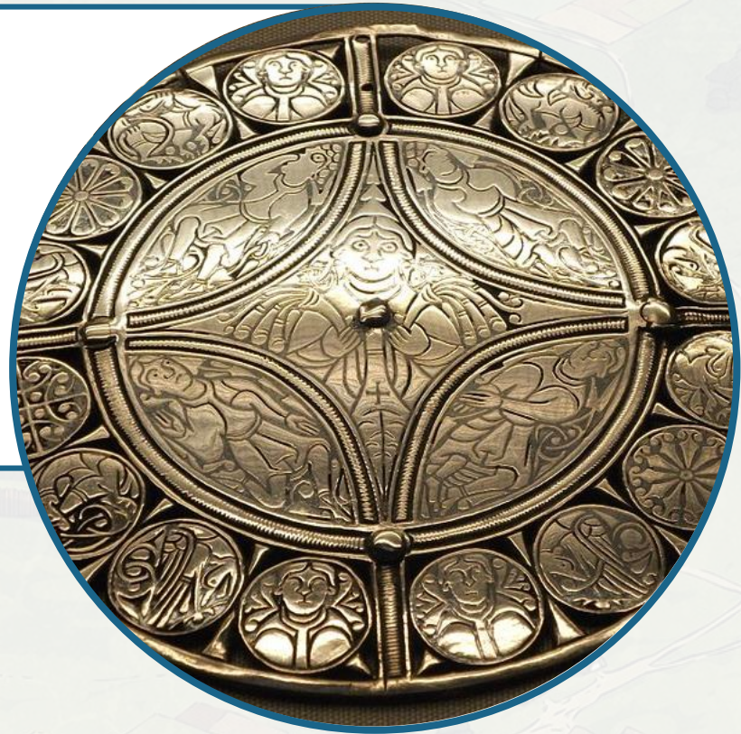
The Fuller Brooch – 9 th century Anglo-Saxon

Niello was a black paste made from copper, sulphur, silver and lead. It was added to the metal and then fired – heated to a very high temperature – to set the paste.